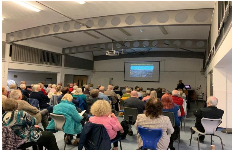
Meeting of 12 th October 2022