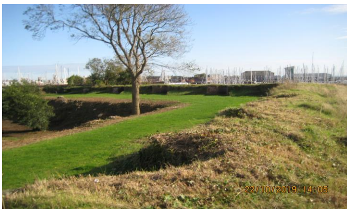
Tragedy Bank (Baston No1)