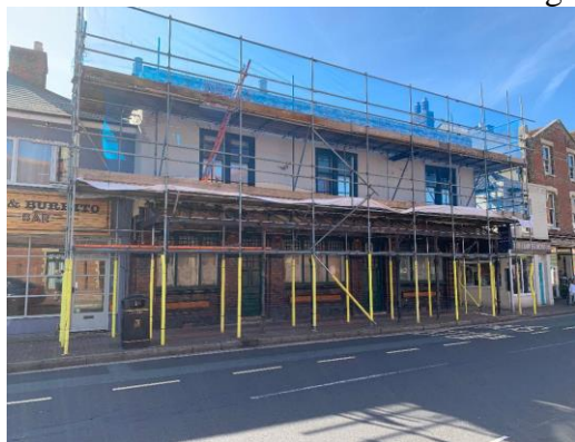
The Royal Arms

Stoke Road projects including The Royal Arms, Blitz Photography, and Properties in North Cross Street. Refurbishment works are being completed to enhance our environment as below.