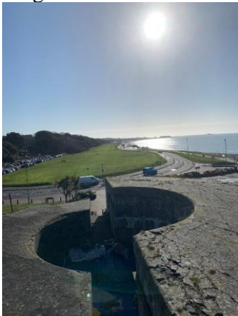
Stokes Bay – view from the Historic Diving Museum

Stoke Bay Conservation Area – Gosport HAZ Project. We are pleased to report that the hard work by GBC (& the community) resulted in planning permission being granted and Stokes Bay is safely designated as a Conservation Area.