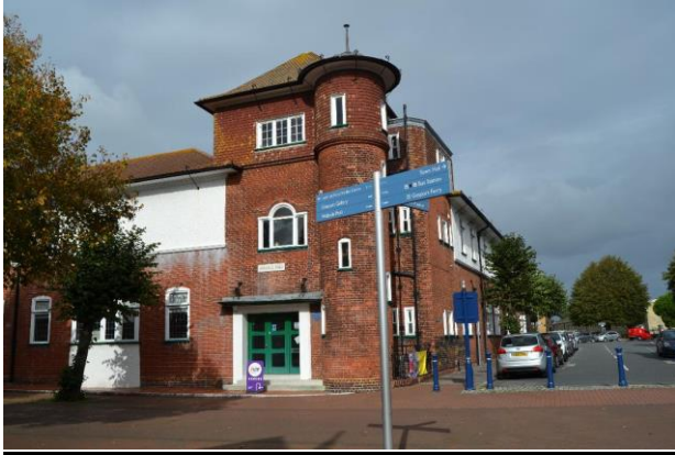
Grade Listed 2 - 'Old Grammar School'

Refurbishment works continue (although promised for an October 2022 completion), with connecting walkway to Gosport Gallery, landscaped courtyard & café, reinstatement of Gosport Museum. Gosport Society had hoped to hold the monthly meeting here, however the facilities offered are not large enough to accommodate us.